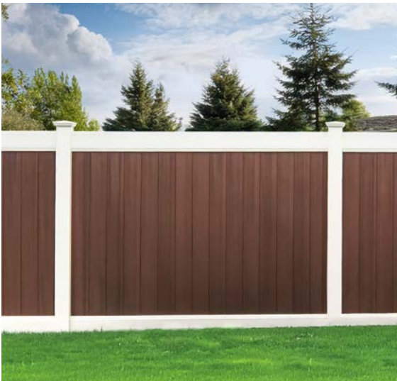
Mahogany and White