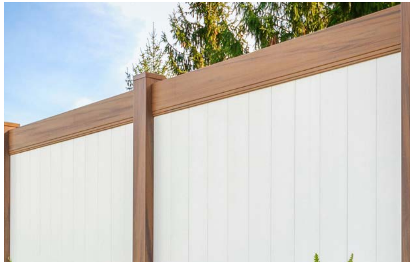
Walnut and White