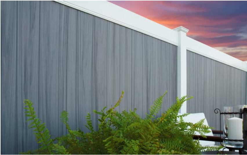
Driftwood and White