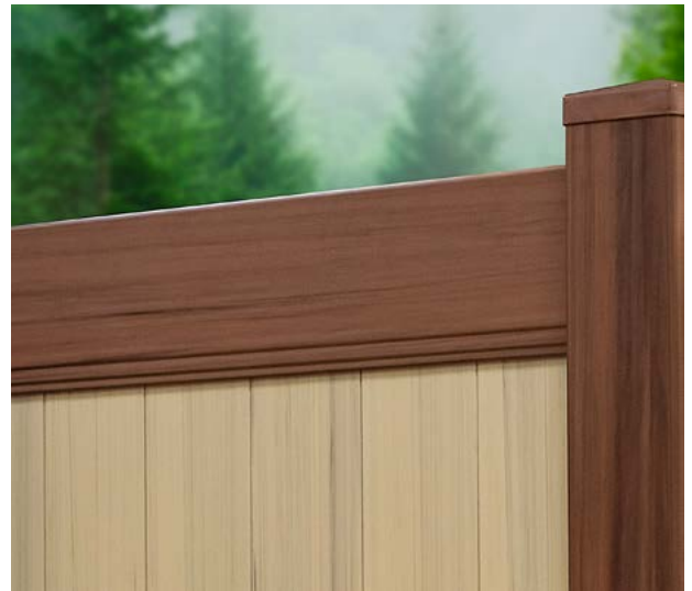
Rosewood and Sahara

All colors shown are approximate. See physical sample for actual color.